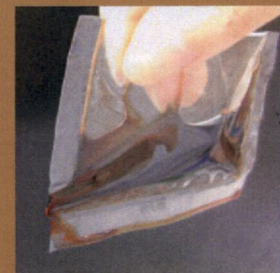
●Difficult to pour